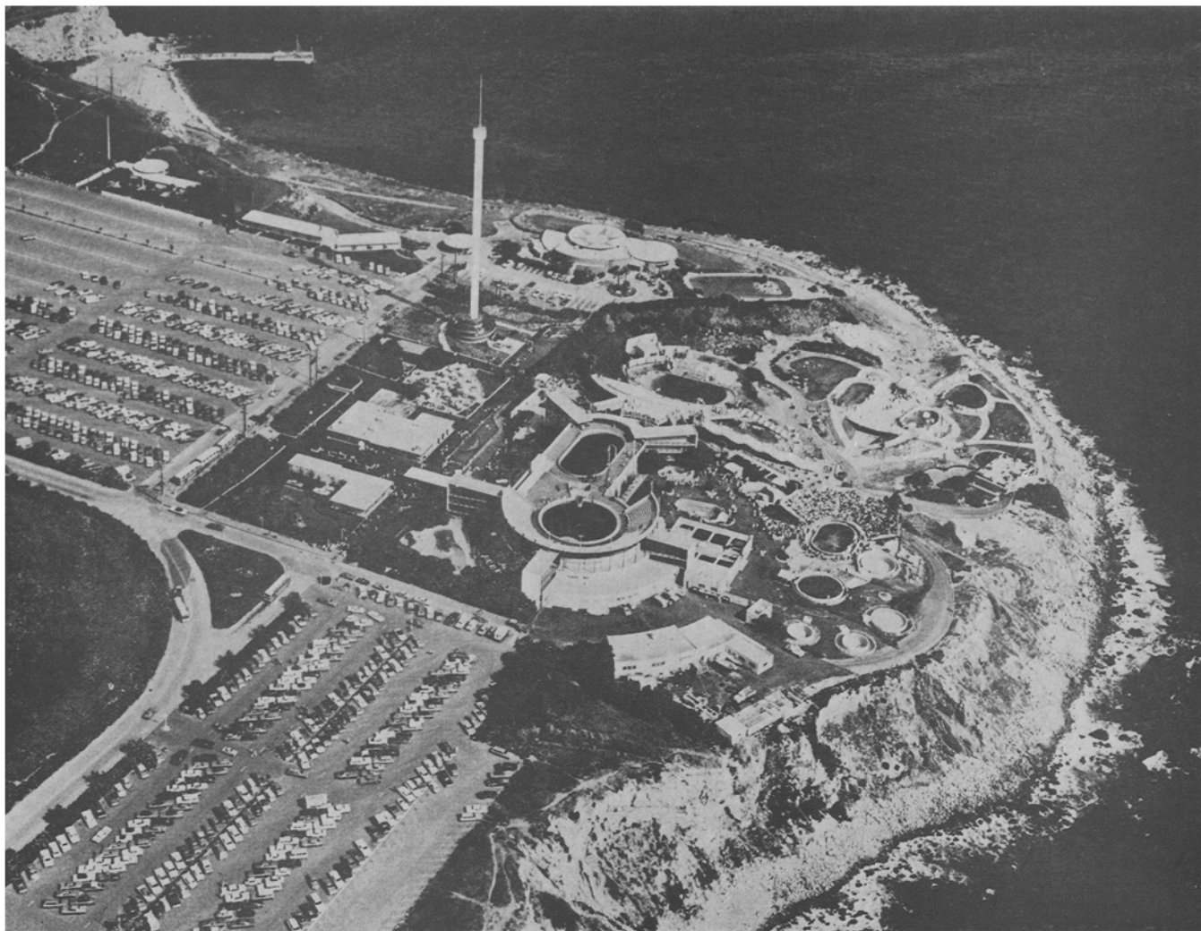
Marineland of the Pacific—aerial view with main oceanarium in center