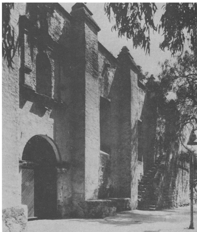
San Gabriel Mission

Other points of interest are abundant. The mountains are within easy driving distance—the Mount Wilson Observatory can easily be seen from downtown Los Angeles. For a change in scenery there is the Mojave desert “just over the ridge.” There are also the harbor areas, both the commercial ones of the Long Beach and the Los Angeles Port Facilities, and the pleasure sites such as Balboa. Of course miles and miles of beaches stretch from San Diego to Santa Barbara, so surf boards and swimming gear are in order. Catalina Island is also close by and a pleasant place to visit during April.