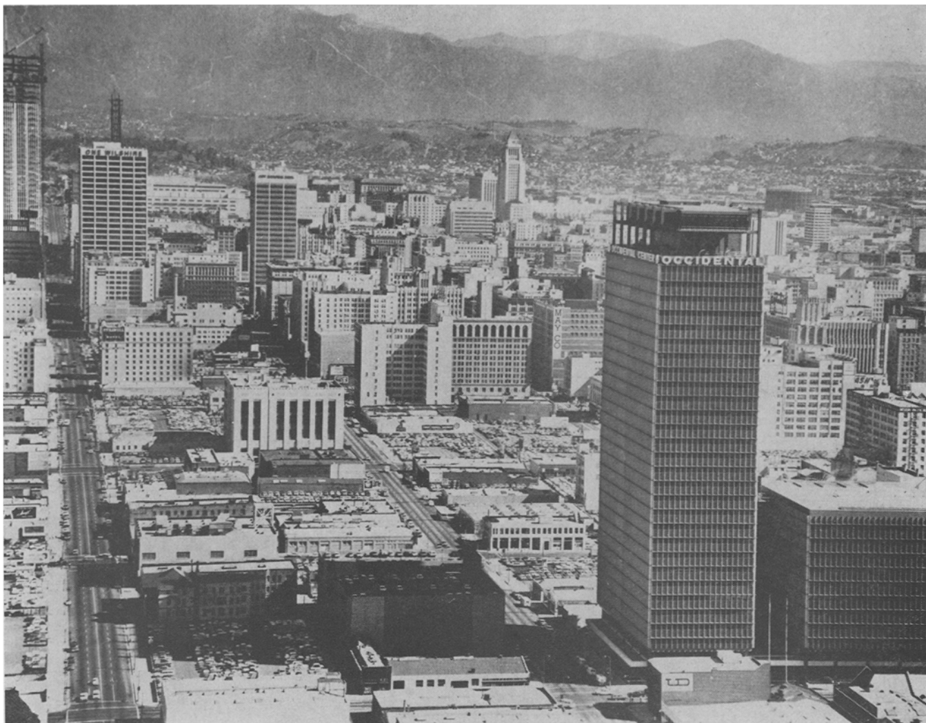
Downtown Los Angeles